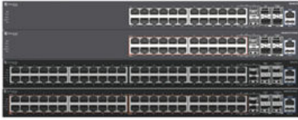
ERS 3600 Stackable Chassis